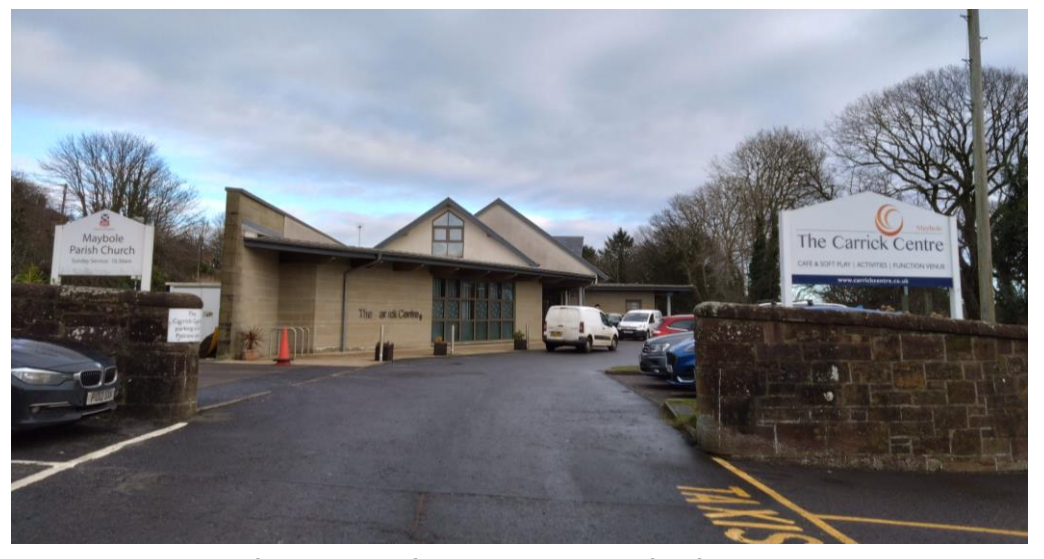
Entrance to the Carrick Centre, Maybole