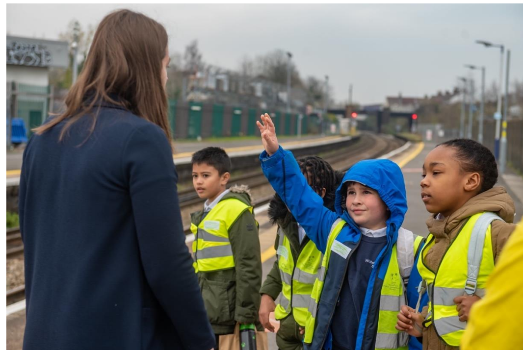
Platform Rail community rail education scheme (Sevenside, Gloucestershire, Worcestershire, and Transwilt Community Rail Partnerships)