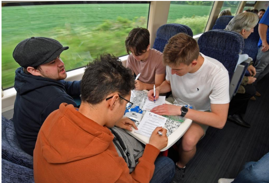
Kent CRP event with Ashford College students in Community Rail Week