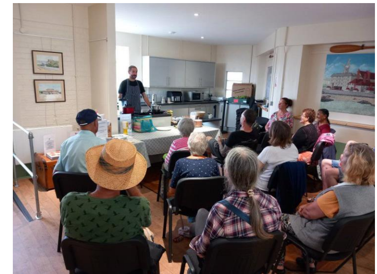
Friends of Bishopstone Station community workshop