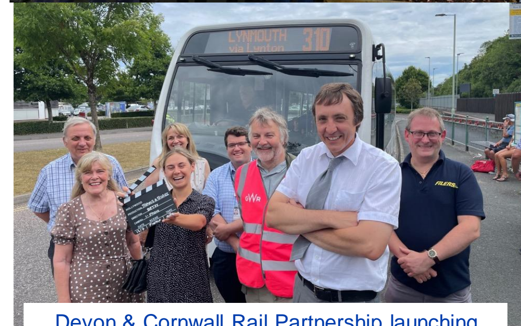
Devon & Cornwall Rail Partnership launching multi-modal promotional videos