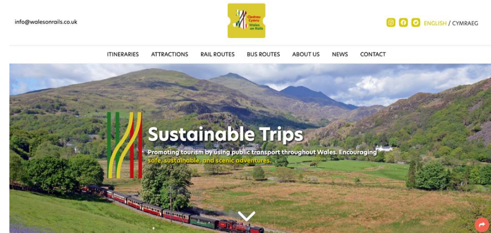
Wales on Rails campaign by Wales & Borders CRPs and Great Little Trains of Wales