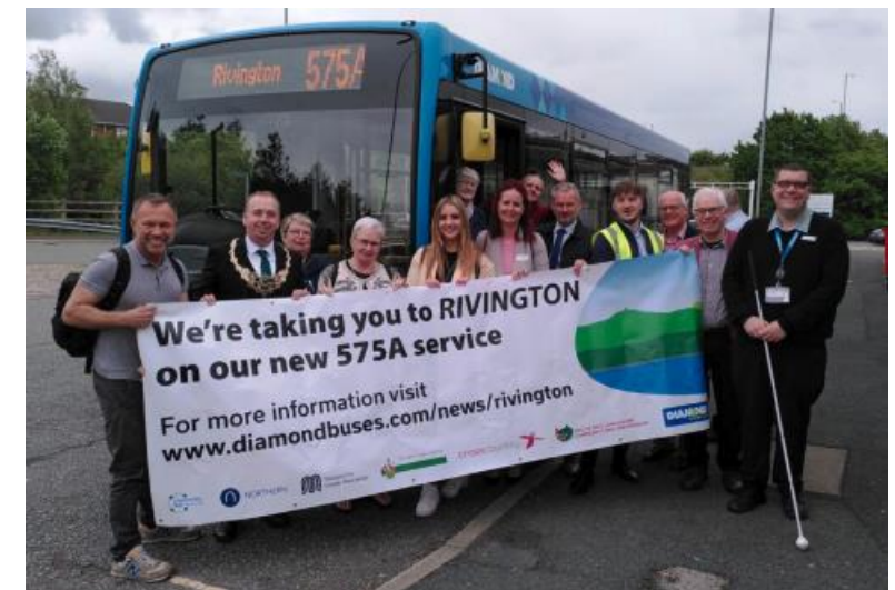
South East Lancashire CRP's Rivington Rambler