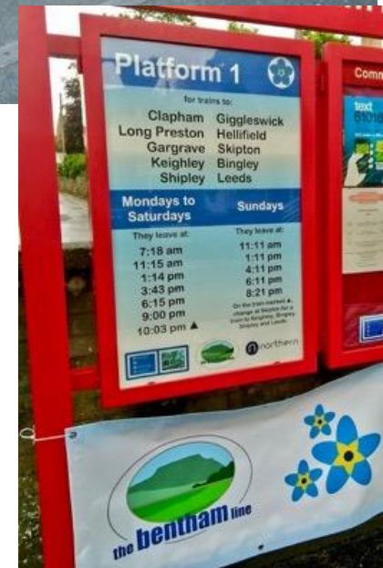
Bentham Line CRP working with Northern & local charities to become a dementia friendly line