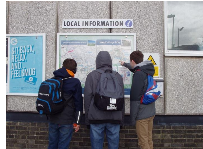
Friends of Wool Station wayfinding and travel information