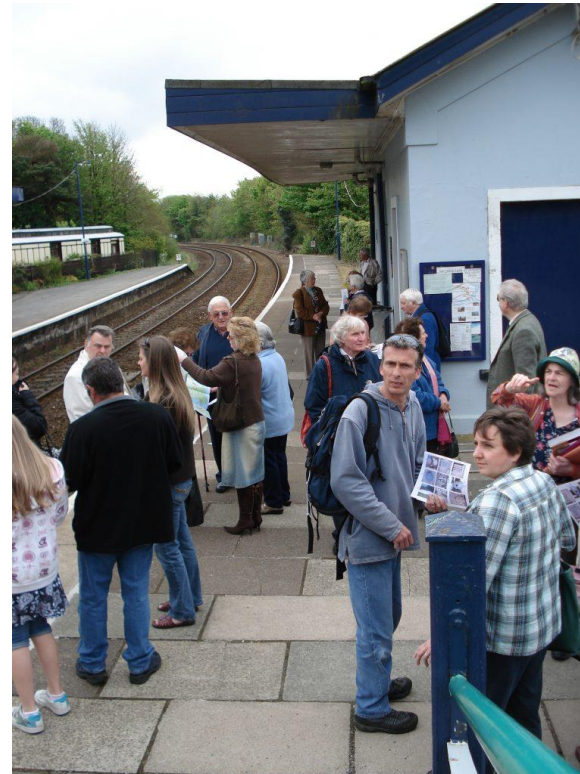
St Germans & Area Public Transport Group consultation on travel needs