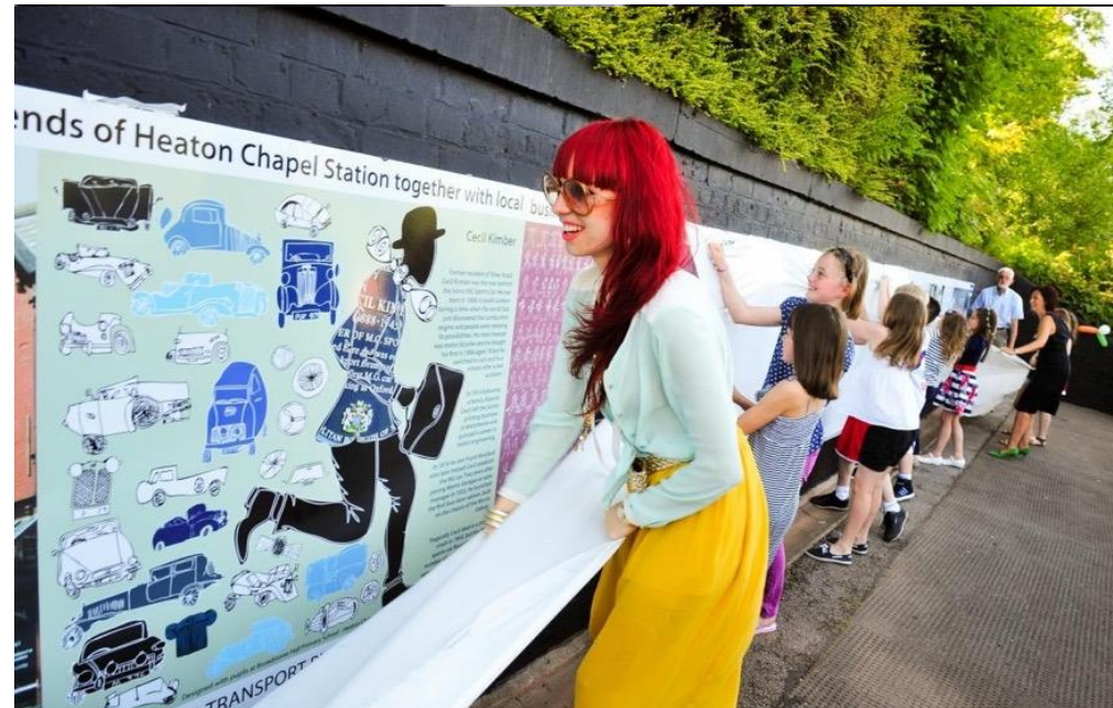
Friends of Heaton Chapel Station arts project