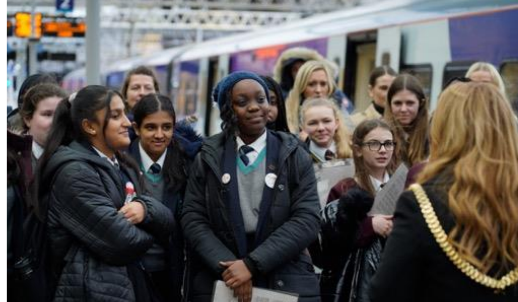
Community Rail Lancashire rail confidence programme